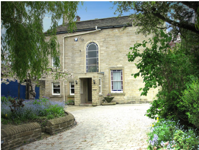
Waterloo Lodge from the gate.

2020 marked the 200th anniversary of our home - Waterloo Lodge and February 2020 saw us complete major renovations, not least the hard surfacing of the drive, probably for the very first time, and the rebuilding of an extension.